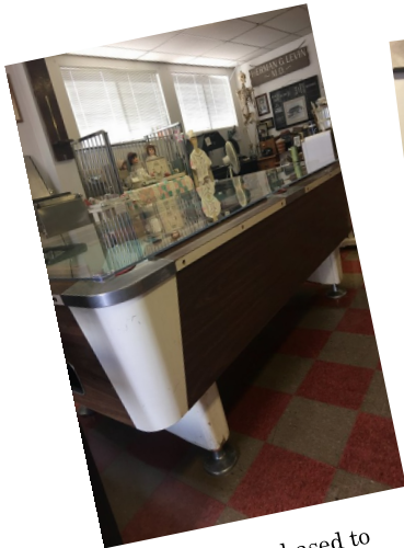
Plexiglass purchased to preserve pool table.