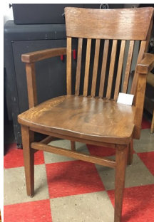
Mill Office Chair