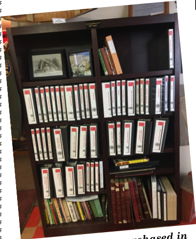
A new bookcase purchased in memory of Allen Vaughn