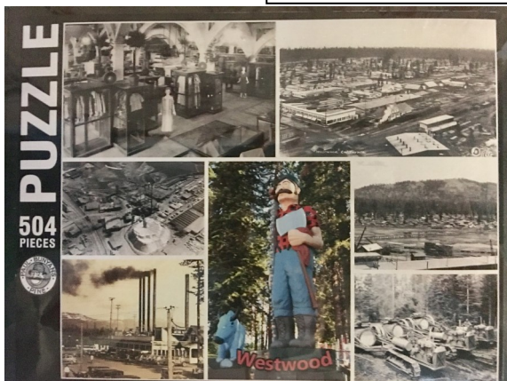
Westwood Puzzle 504 Piece $20

Email us to order. All prices include tax. Shipping will be added to invoice.