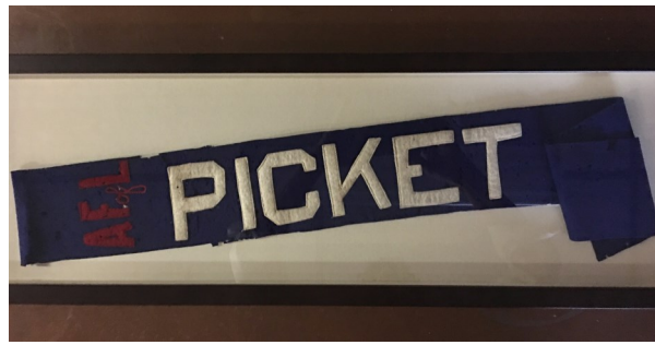
Picket sash from 1938-39 preserved by framing.