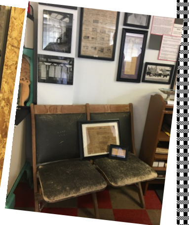
Original Theater Seats