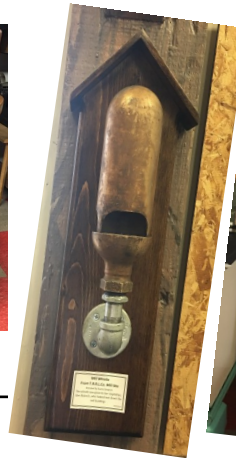
Whistle from old mill site.